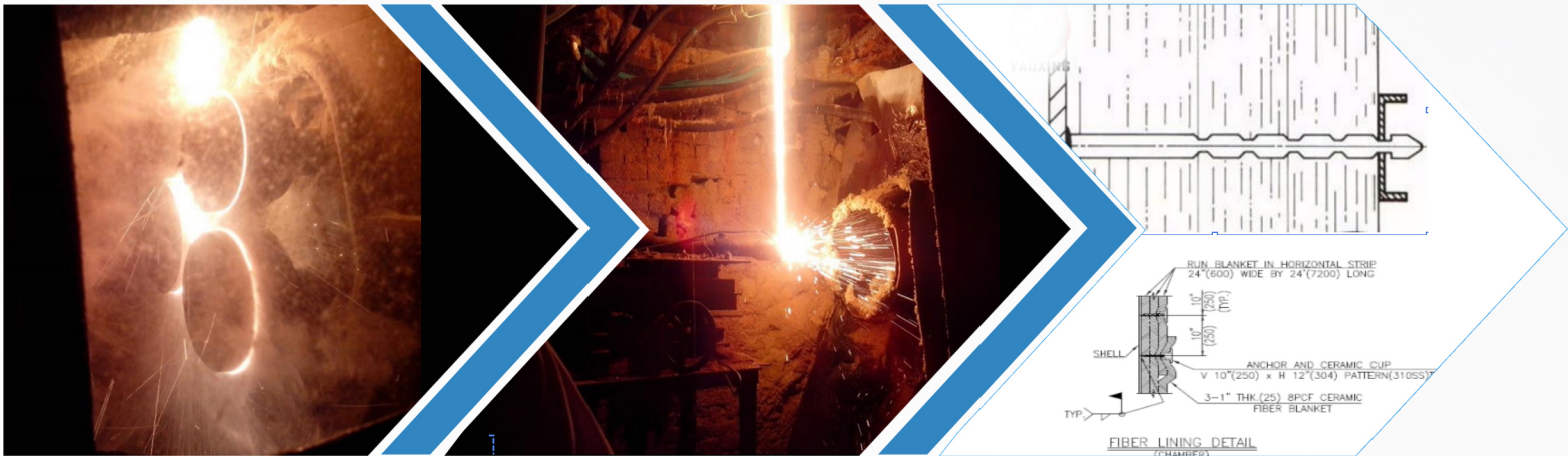
Ceramic Fiber Spun